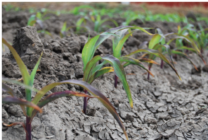
Phosphorus-deficient corn plants.

the quality of fruit, vegetable and grain crops, and is vital to seed formation. Adequate P increases plant water use efficiency, improves the efficiency of other nutrients such as N, contributes to disease resistance in some plants, helps plants cope with cold temperatures and moisture stress, hastens plant maturity, and protects the environment through better plant growth.