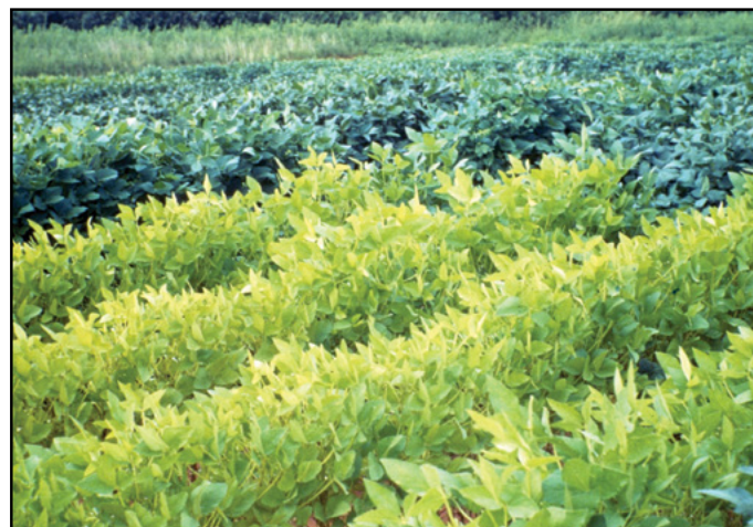
Soybeans showing Mo deficiency in the foreground.

In many soils, application of a liming material to increase pH will release Mo from insoluble forms. For example, a study showed that addition of lime alone resulted in the same soybean yield as when Mo fertilizer was added to unlimed soil 2 . However, the chemical release of soluble Mo following lime application may take weeks or months to occur.